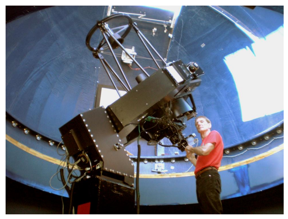
Figure 2. Rich Williams in SSO Observatory Markleeville, CA.